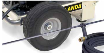
Flat Free Tires