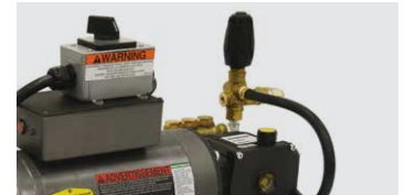
VRT3 with Bypass Loop