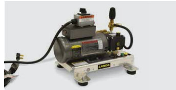
Modular Design shown with optional Skid Mount Feet