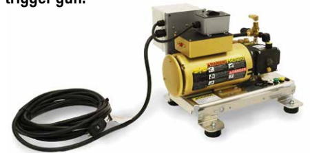
HD 1.8/1350 Ed equipped with Auto Start/Stop shown with optional skid mount feet