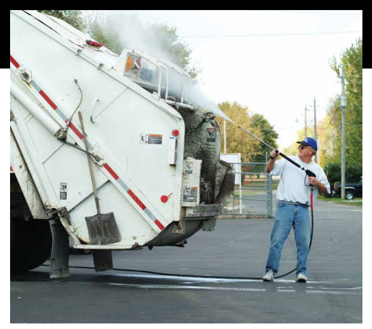
The PGDC is designed to handle the toughest of outdoor cleaning jobs.

Using a 12-volt DC burner assembly offers a rugged skid frame with robust cleaning performance specifications at an economical price. This self-contained workhorse can tackle virtually any outdoor cleaning project once you provide the water. An optional wheel kit makes this already versatile machine even more portable, allowing for easy transport on-site. With a reliable Honda or Vanguard gasoline engine, this machine can provide hours of continuous worry-free cleaning power.