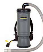
BV 7/1 VAC PAC 6 HEPA