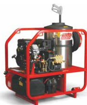
Model 1080BE 4.6 GPM @ 3500 PSI; Briggs Vanguard gas engine (shown with optional stainless steel coil wrap and skid rails)