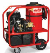
Model 1075BE 4.0 GPM @ 3500 PSI; GX390 Honda gas engine (show ith optional caster kit)