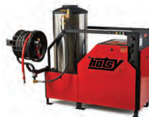
Black Label version comes with hose & hose reel