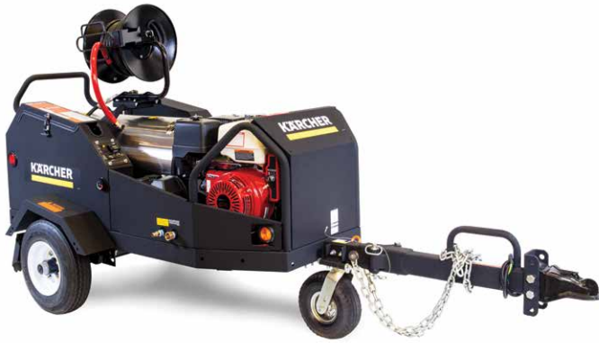
Shown with optional hose reel