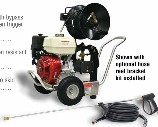
Shown with optional hose reel bracket kit installed