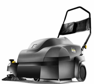
CVS 65/1 BP