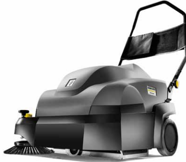
CVS 65/1 BP