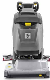
B 50 W BP AGM