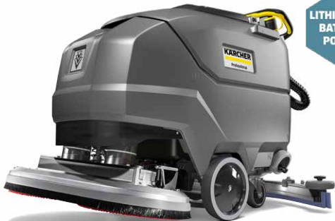
BD 70/75 W BP CLASSIC