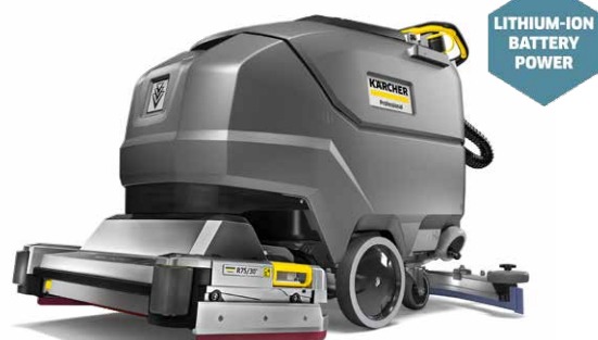
BR 75/75 W BP CLASSIC