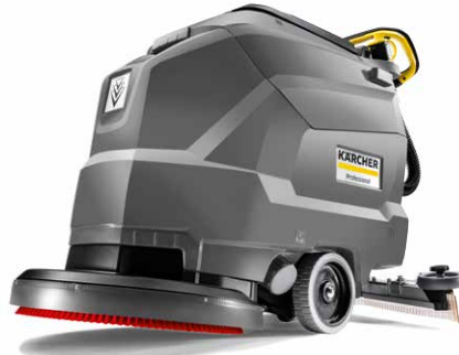
BD 50/50 C BP CLASSIC