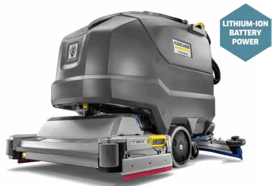
BR 85/100 W BP CLASSIC