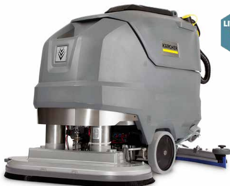
BD 80/100 W BP CLASSIC