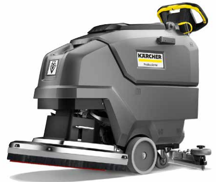
BD 50/55 W BP CLASSIC