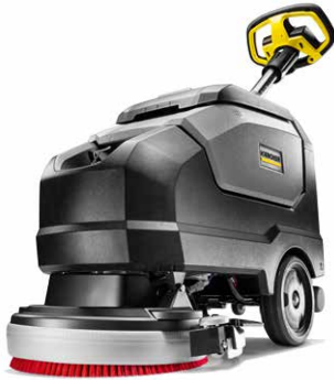
BD 35/15 C BP CLASSIC

Designed to meet all of your scrubbing needs without breaking the bank. With the BD 70/75 W Bp Classic, BD 75/75 W Bp Classic, BD 80/100 W Bp Classic, BD 50/55 W Bp Classic and BD 50/50 C Bp Classic scrubbers, Kärcher presents its Classic Scrubber line. These machines are battery-operated, have a very solid construction, and are characterized by their simple operations.