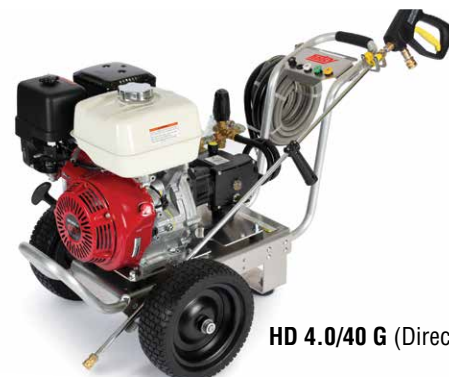
HD 4.0/40 G (Direct)

Low profile handle with cushioned grip is easy to push and pull