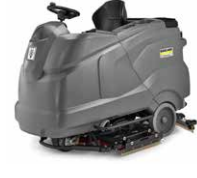
B 200 R BP WITH 2 SIDE BROOMS + R 85