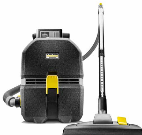
BVL 5/1 Bp