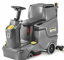
BD 50/70 R BP