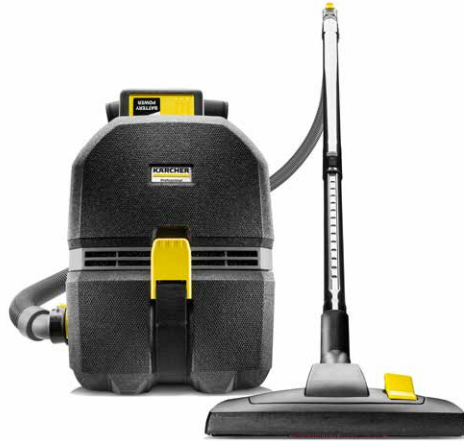
BVL 3/1 BP