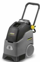
BRC 30/15 C