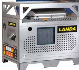
PDHW5-35624E/SS shown with optional stainless steel Lift/Stack Platform Kit and Emergency Air Shutoff Kit