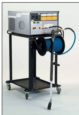
1700 Series shown with optional hose reel kit (PN 8.903-039.0) and Tall Floor Stand (PN 9.801-034.0).